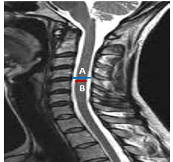
Figure 1. T2-weighted magnetic resonance imaging of the midsagittal cervical spine with illustration of measurements obtained. (SAC=A-B)

Data was analyzed using both inferential